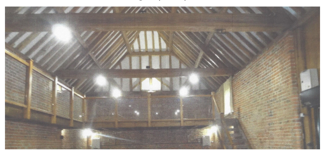
South gallery in May 2017

Both internal brickwork and any woodwork with problems have been repaired. New doors have been put in where necessary.