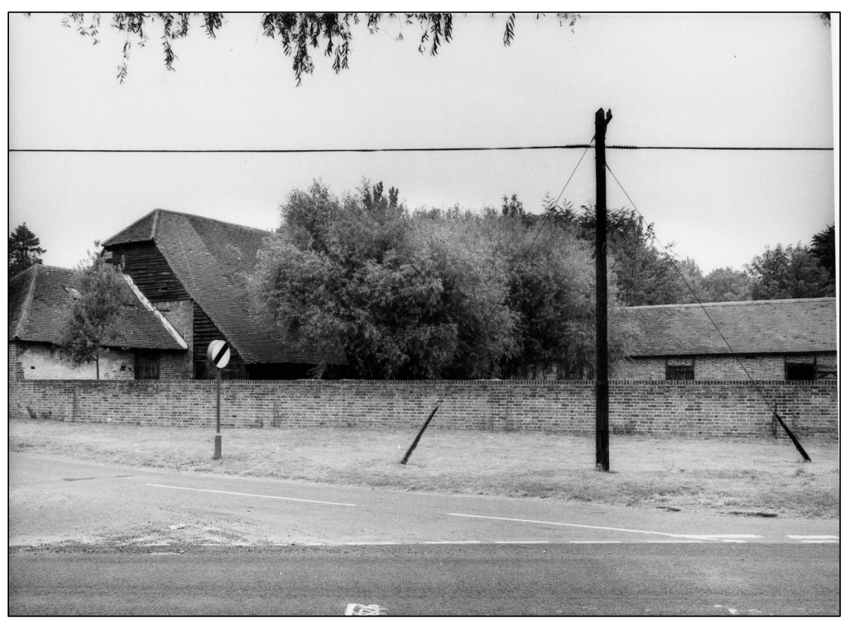
South end of barn showing weatherboarding 1972