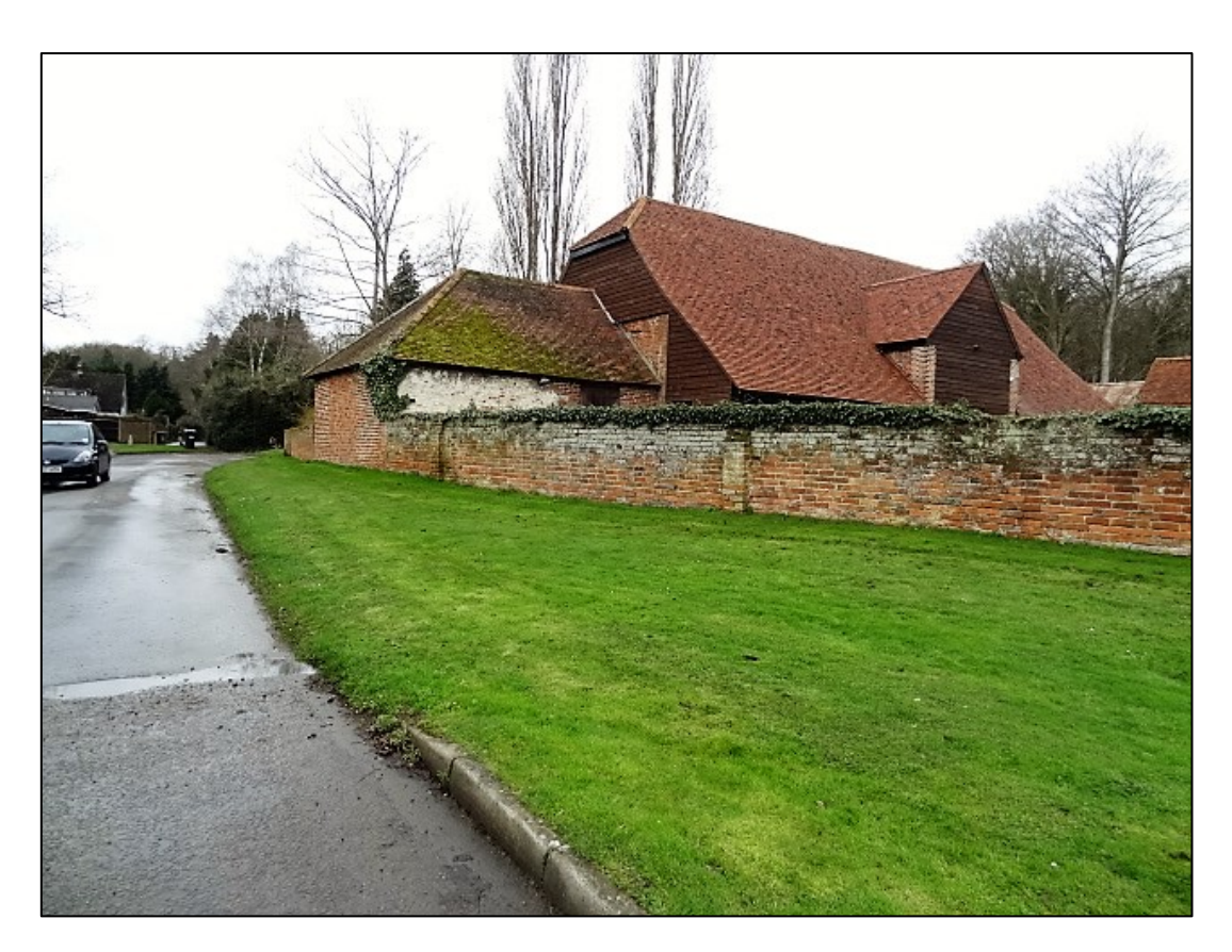
Note above weather boarding on south front gable