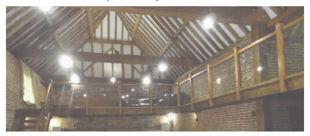
North gallery in May 2017

Inside other work done has been a completely new floor with foundations, insulation and a concrete screed with slabs on top. In addition, galleries have been erected at both ends.