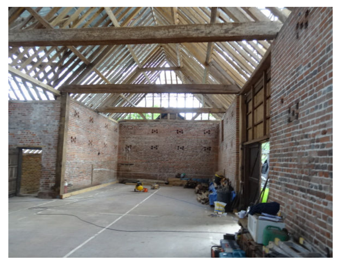
This picture taken in June 2016 shows the inside framing including one of the strengthening oak posts.