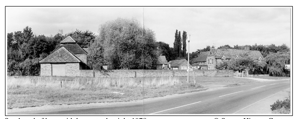
South end of barn with house to the right 1978